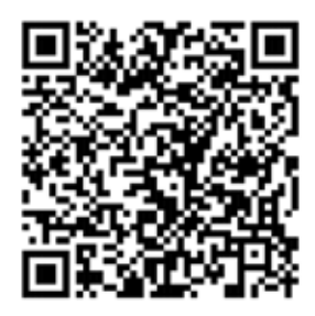
Scan QR code to view booklet on mobile device 312